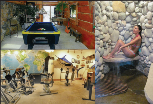
GAME ROOM, WEIGHT ROOM & WET SAUNA

THE RANCH BORDERS HUNDREDS OF MILES OF BLM LAND. HUNTING, ATV EXPLORING AND HORSE BACK RIDING CAN ALL BE DONE FROM OUR BACK GATE. YOU CAN ALSO FLOAT AND FISH THE CLARK FORK RIVER, WHICH IS WITHIN A MILE OF THE RANCH.