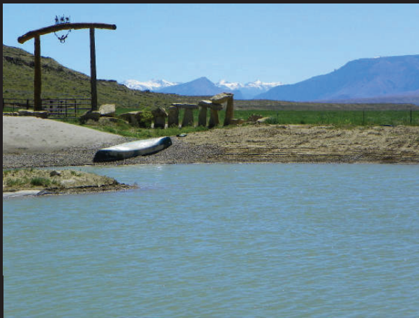
STOCKED FISHING POND